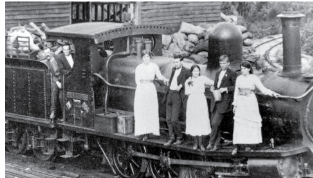
'The Blackwood' locomotive.

enjoying the rich bounty of food from the land and waterways. St John Brook is believed to have been a travel route for Nyoongars as they moved from the coastal lowlands at the end of the warmer months to the open woodlands inland as water spread across coastal areas. It is believed that Nannup, only eight kilometres from the park, means 'A place to stop and rest'.