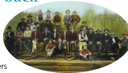
Barrabup Mill employees.

For thousands of years before European settlement, Nyoongars lived as hunter-gatherers